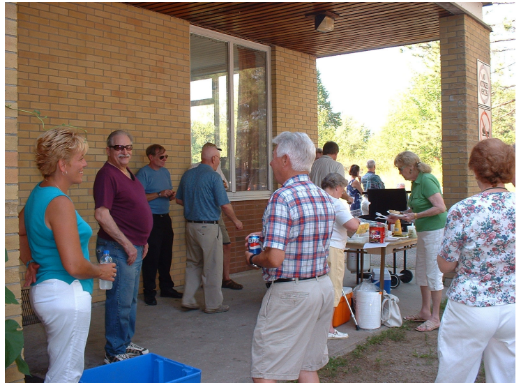
Members of the Ryde Community mingle with Town Councillors at the BBQ before the Council Meeting in Ryde

Prior to the meeting, we had our now-traditional hamburger BBQ, which was well-attended by both Council members and the general public. Local Ryde folks mingled with our councillors, and were able to discuss their particular issue with members of Council one-on-one.