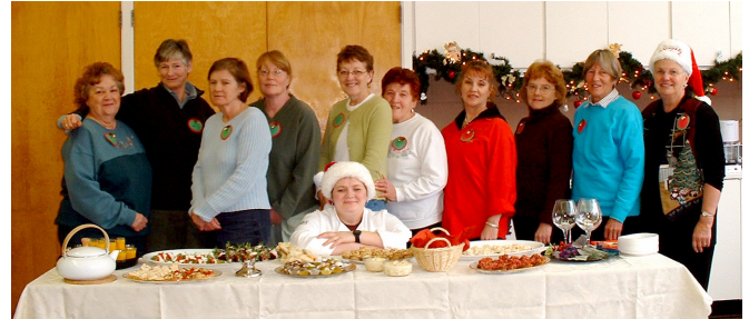
Participants in the Appetizer and Finger Foods Demonstration made Truffles, Tuxedo Strawberries (shown), and Tomato Bocconcini Bites, as well as several other delicacies.