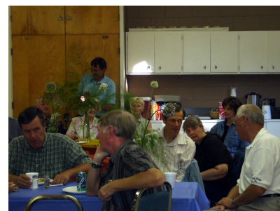
Bottom Photo: Community members and Council Members enjoy the BBQ dinner