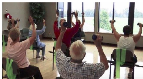
A program of

Minds in Motion is a program that combines physical activity and mental and social stimulation for individuals with early to mid-stage Alzheimer's disease or other dementias, and their care partners. This program runs once a week for 8 weeks and offers a great environment to establish new friendships with others who are living with similar experiences.