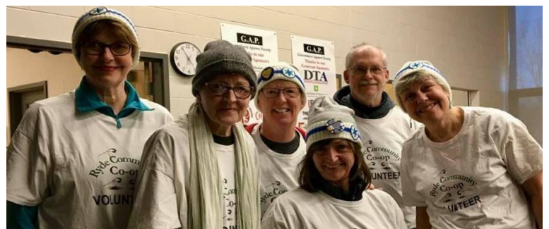
Some of Last Year's CNOY Team Members